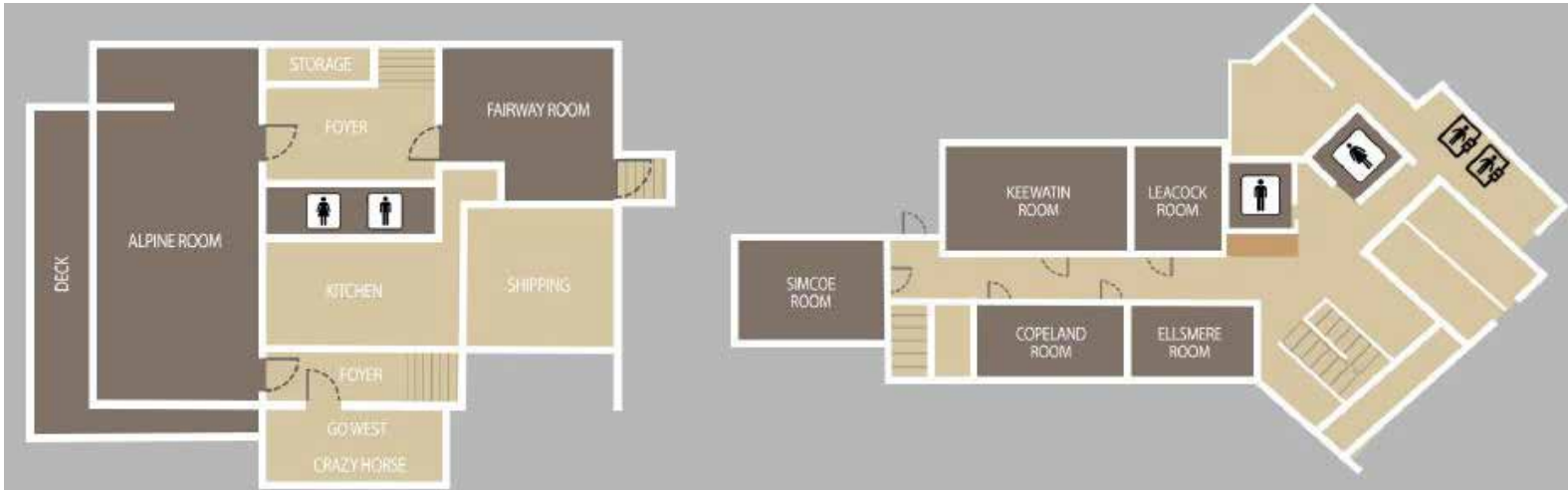
The Inn at Horseshoe