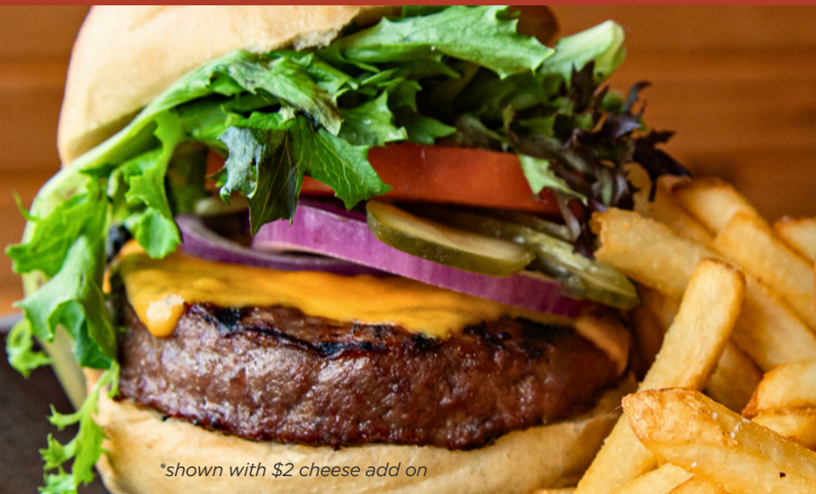
*shown with $2 cheese add on